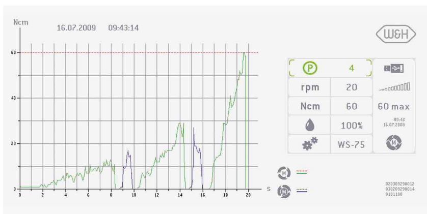
Recording of torque for a treatment step, including the parameters set

Each step in the application is completely documented and can be accessed at any time using the USB interface and the USB stick, which is included in the delivery.