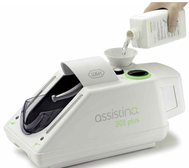
W&H Service Oil F1 in the MD-500 bottle for use in the Assistina

W&H dental drives achieve top speeds of up to 390,000 r.p.m. F1 provides excellent lubrication